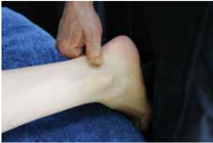
Friction of the medial and lateral surfaces.