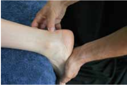
Friction of the posterior surface.