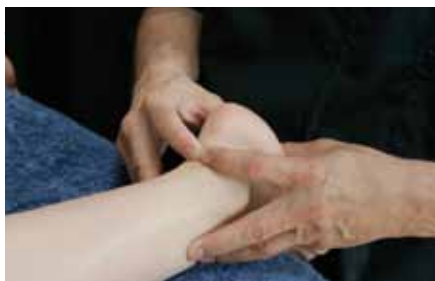
Friction of the distal tendon.

Friction of the distal tendon at the calcaneal attachment. Again, have the foot fully plantarflexed on the table so the tendon is relaxed. Place your index fingertips on the calcaneal attachment, with your thumbs under the heel. Press firmly and draw your index fingers across this area by moving your forearms from side to side.