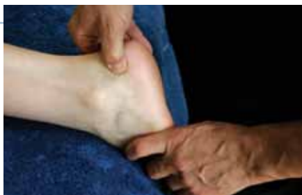
Friction of the distal aponeurosis.

Ask your client to sit on the floor with the knee bent at a 90-degree angle and the fingers wrapped around the ball of the foot. Have the person actively dorsiflex the foot as far as possible, then use the hands to pull the ball of the foot toward the shin for up to two seconds (no more), and then place the foot back on the floor. Repeat 10 times, followed by 10 repetitions of the same stretch with the foot everted, and then 10 repetitions of the stretch with the foot inverted. Next repeat all three stretches—straight, everted, and inverted—with the