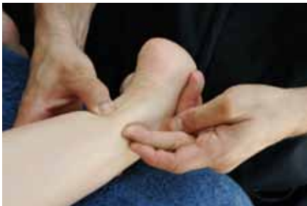
Friction of the anterior surface.

have the client repeat the test while standing on the injured leg only. If the tendon is injured, the location of the pain tells you the location of the injury, because this tendon doesn't refer pain to any other areas.